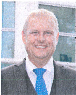
Sir David Grant Chair